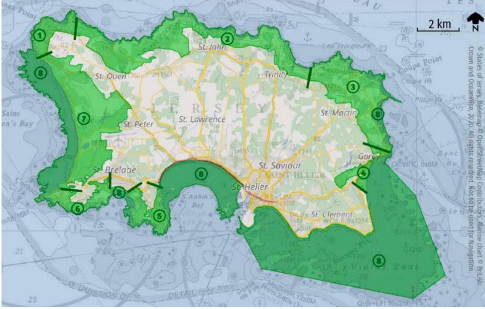
Extract BIP, 2021